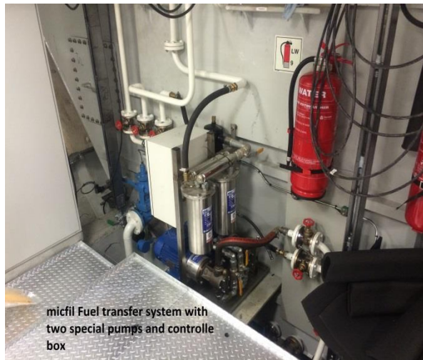
micfil Fuel transfer system with two special pumps and controle box